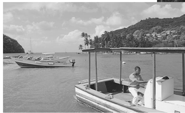
Several developments are being built on St. Lucia, including The Landings, above, and Discovery at Marigot Bay, right. Residents use the local ferry, left, to reach the other side of Marigot Bay.