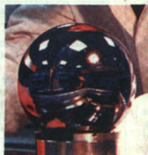
Silicon sphere Otto Pohl

A crystal sphere that weighs exactly one kilogram is created. Since its atomic structure is known, by measuring the sphere's diameter one can calculate how many atoms it contains. That number would define kilogram.